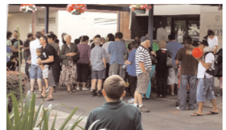
The Puppet show drew a crowd each show