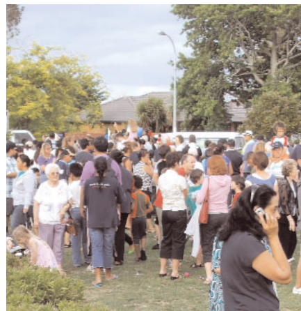
Joining in the after parade activities