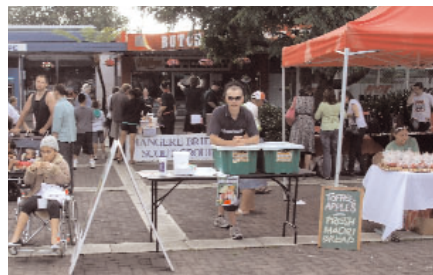
Waiting for the crowds to arrive

After travelling through the Village the Parade finally ended up at the Bill and Naomi Park for the after Parade function