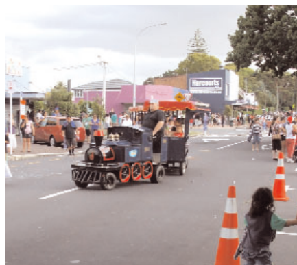
Train rides were popular with the children